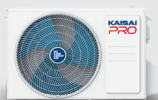
Outdoor unit KRP